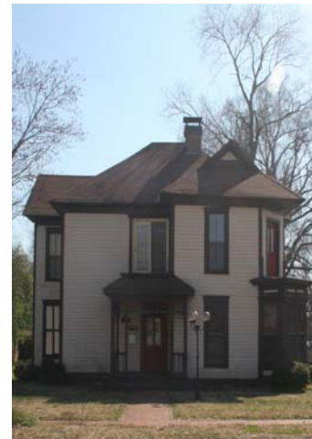
Jacob's Place located at 310 E. Market St. Searcy, AR 72143

A house was leased at 301 E. Market St. in Searcy, AR from the First United Methodist Church. It houses up to 16 persons. Adult residents are required to find and maintain employment within two weeks of entering Jacob's Place. Each resident will be expected to save the majority of their earnings in order to