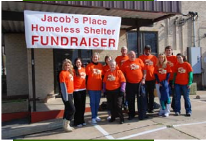
Some of the many volunteers at one of Jacob's place fundraiser at Searcy's Rendezvous

Newsletter design and set-up courtesy of Carole's Copy & Print.