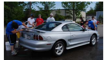
Several volunteers at one of the many the carwash fundraisers.