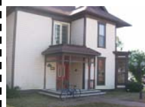
Jacob's Place Homeless Shelter 301 E. Market St. Searcy, AR 72143